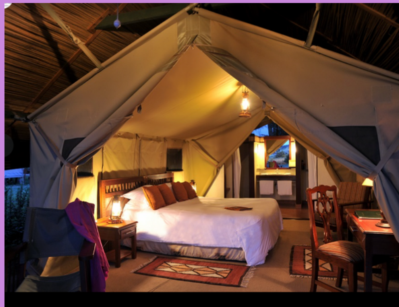
A glimpse of your accommodation