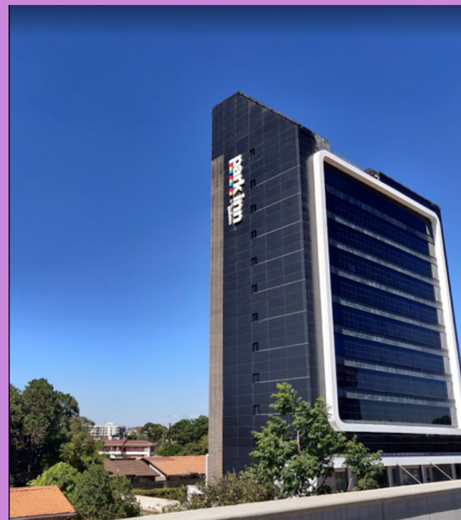
A glimpse of your accommodation

Welcome to Nairobi. Your adventure begins as you land at Jomo Kenyatta Airport and are warmly greeted by our local team. From the airport, we'll escort you to your comfortable hotel. The day is yours to unwind after your journey or explore the vibrant city of Nairobi. Should you wish to explore, your travel guide and coordinator, Tessa, will be there to assist with any arrangements you desire. (There will be an AM and PM pickup time from airport to hotel). Meals Included: Breakfast